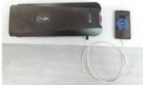
The battery can charge your mobile phone