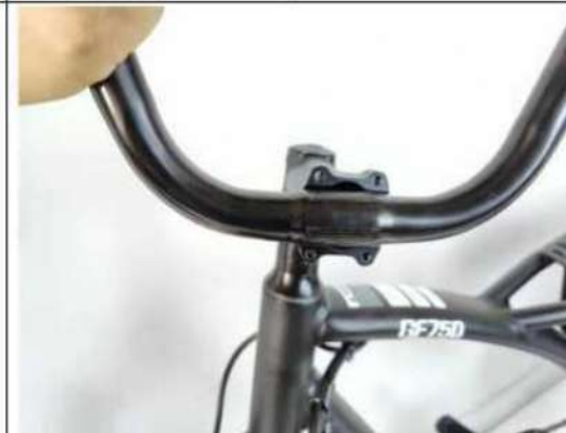
Fit the stem and handlebar together