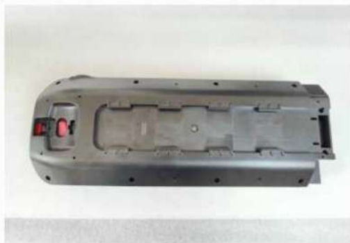
The switch of the battery is on the bottom