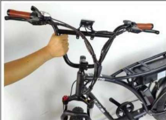
The correct orientation of the handlebar