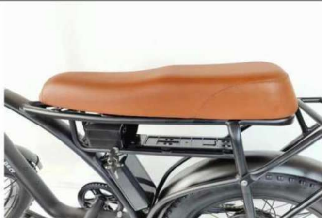
Put the saddle on the frame