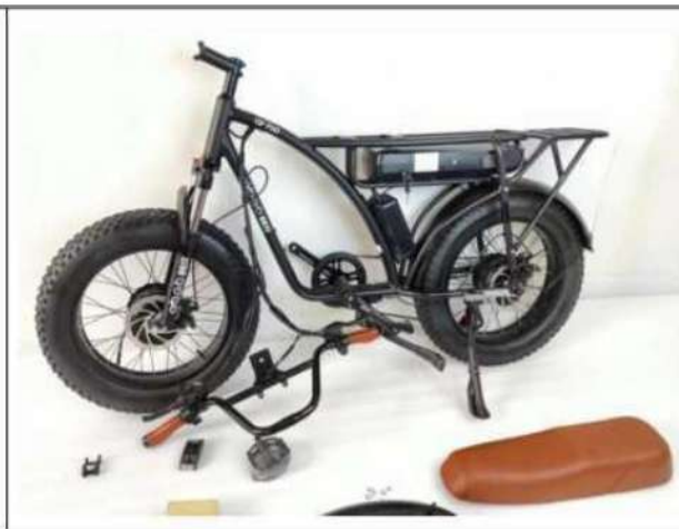
Front wheel installation completed