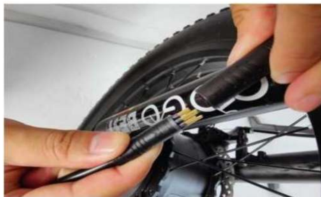
Connect the front motor cable