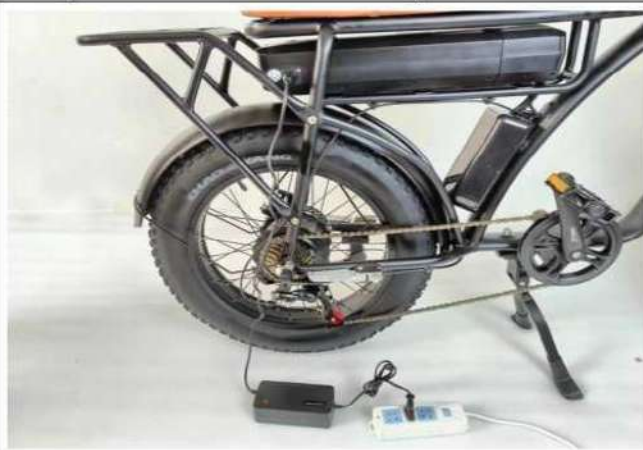
Two ways to charge the battery