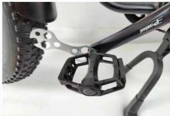
Turn spanner counter-clockwise to fix the pedal L on the left side