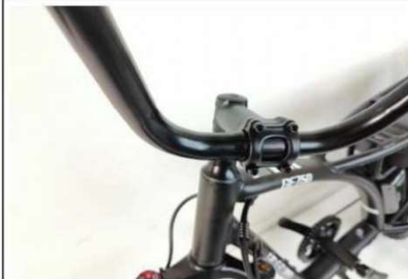
Handlebar installation completed