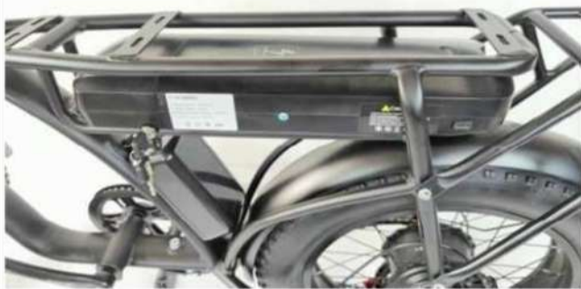
Remove the battery