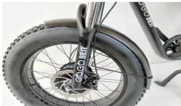
Ready to install the front fender