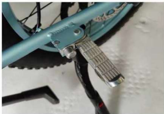
Rest foot while sitting on saddle, do not trample on it heavily .