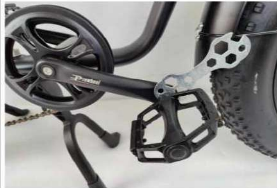
Turn the spanner clockwise to fix the pedal R on the right side