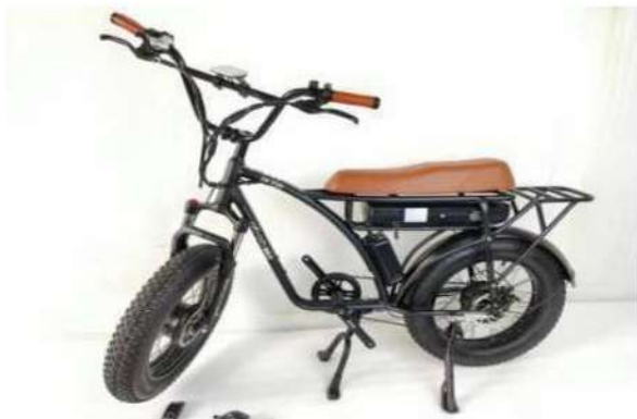
Saddle installation completed