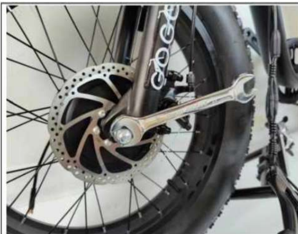
Tighten the nuts on both sides