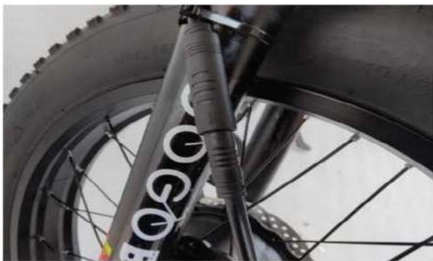
Arrow to arrow