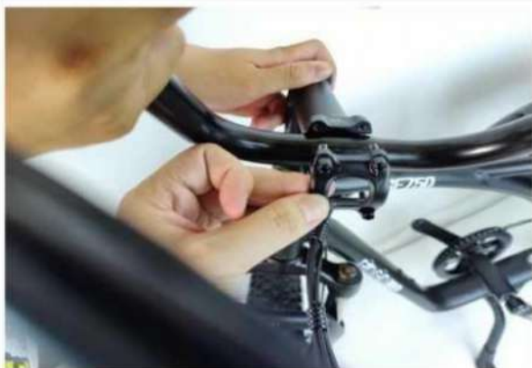
Tighten the 4 bolts