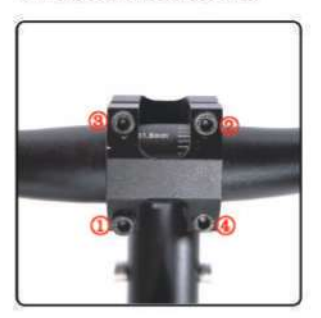
③ Progressively tighten the bolts in sequential order (1 to 4), ensuring equal tension balance between the mount and handlebar.