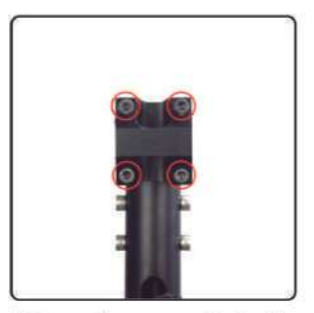
① Loosen the screws on the handle mount with a 4mm hex wrench, which is included in the basic tool kit.