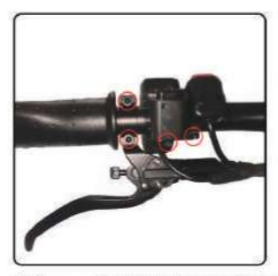
Make sure the brake lever screws and the other two screws are tightened.