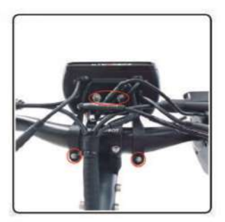
Check whether the bracket screws are tightened.