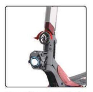
Loosen the knob in the direction of the arrow.