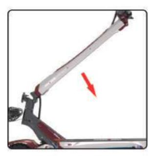
③ Lower the handlebar.