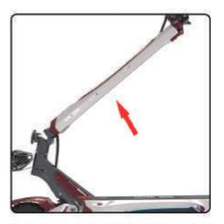
(1) Push the handlebar in the direction of the arrow.