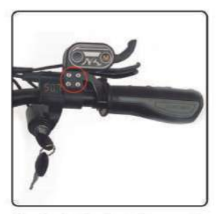
Check whether the LCD control panel screws are tightened.