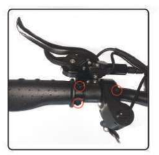
Check whether the brake lever screws and the voltage lockare screws are tightened.