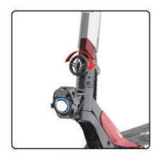
② Align the ] -shaped buckle with the grooves, then tighten the folding knob.