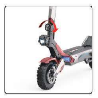
③ Make sure to perfectly align the ]-shaped buckle.