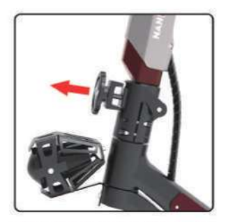
② Keep loosening the folding knob until the 1-shaped buckle completely leaves the grooves